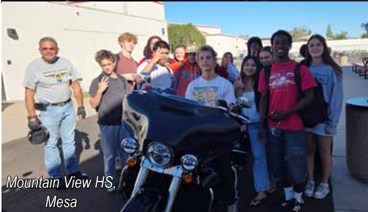
Mountain View HS, Mesa