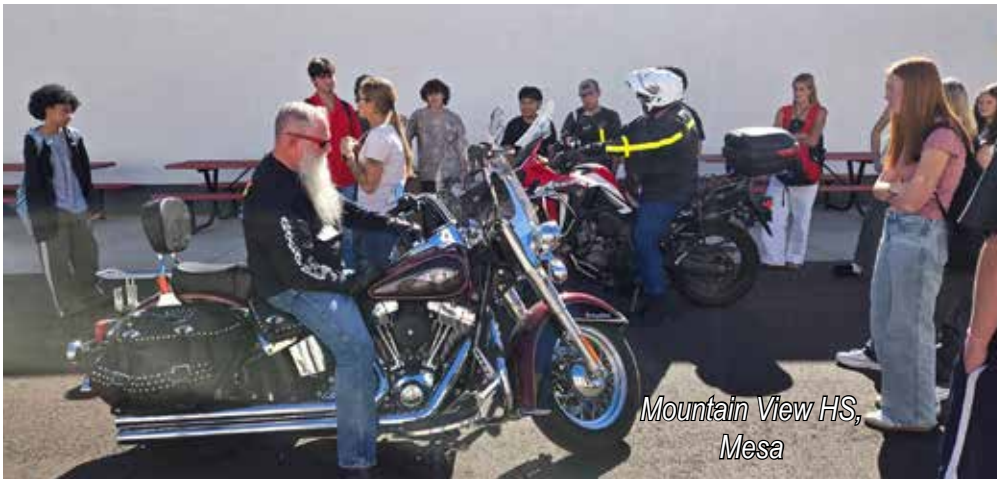
Mountain View HS, Mesa

importance of safely sharing the road with motorcyclists.