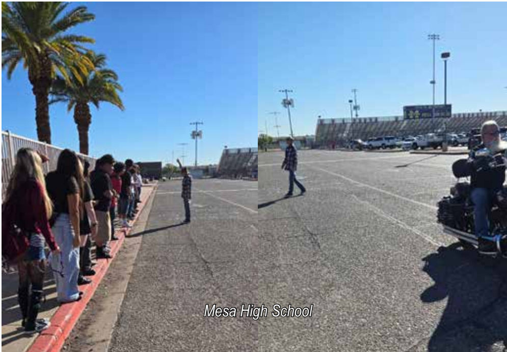
Mesa High School

TEACH people the right way to Lane Filter SHARE this QR code