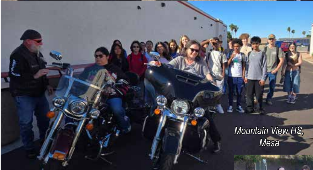
Mountain View HS, Mesa