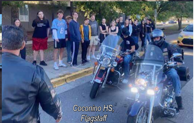
Coconino HS, Flagstaff