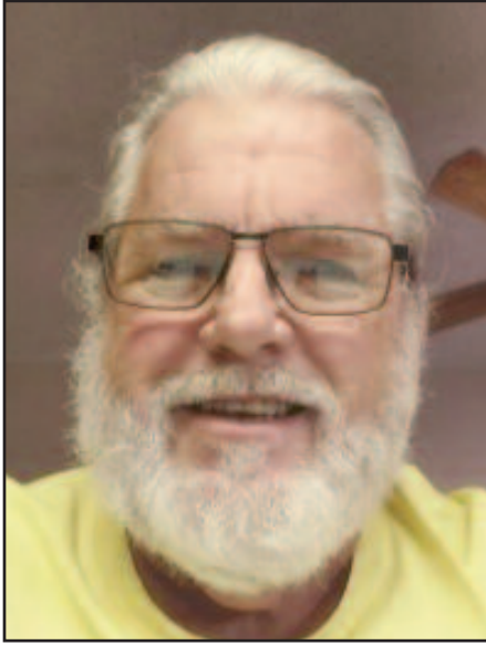
Greetings Fellow Freedom Fighters!

Happy New Year! I hope everyone had a Great Holiday Season! This year looks to be a very good year for ABATE of Arizona and the 8 Chapters in our state. There are several upcoming events that we are looking forward to.