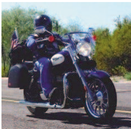
By Woody Phillips – Chairman

Riding down a deserted highway, at 5 miles under the speed limit, a cop who passed me going in the opposite direction, suddenly swings around and comes up behind me with lights and siren. Pulling over, I am immediately ordered off my bike at gunpoint and told to lie on the ground. After a thorough search of both me and my motorcycle, during which my vest is confiscated, I am handcuffed, and placed in the back of the patrol car.